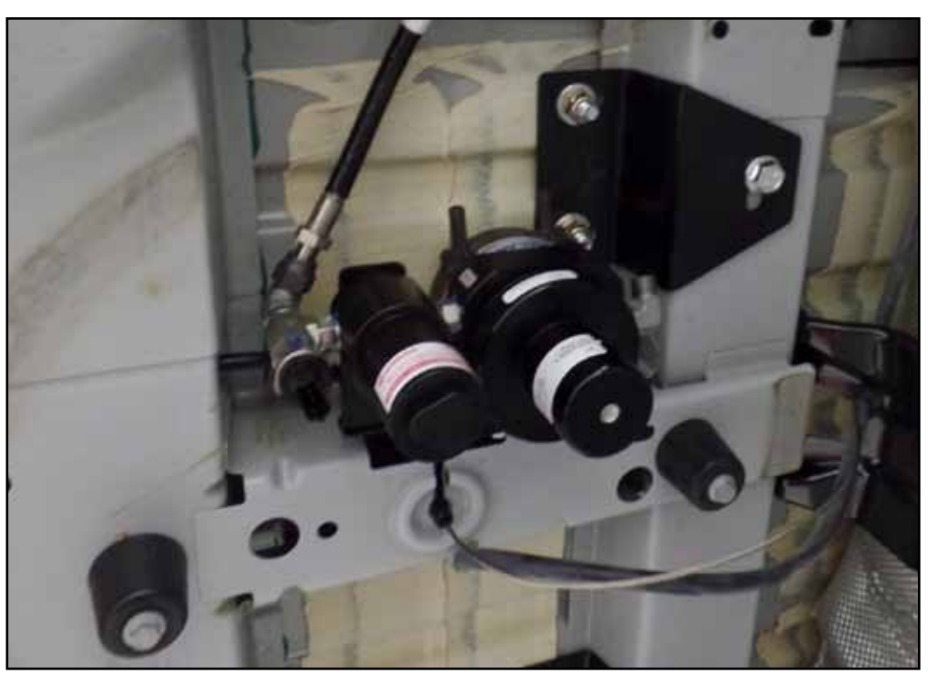
Transit Connect 2.5L